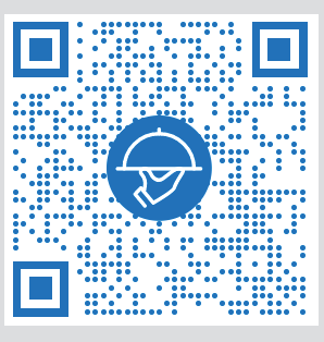
Mobile Ordering is available from 6am to 9pm

PLACE YOUR ROOM SERVICE ORDER THROUGH MOBILE ORDERING OR CALL EXT. 6920